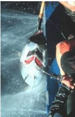
Catch and haul fish

4. Fishing can then start: the fishermen cast feathered jigs into the water and haul them back systematically a few seconds later. When fish are larger than 8-15 kg, double poling may be necessary. If a tuna is caught, the movements is prolonged and the tuna lands on the vessel's deck where it releases itself from the hook (because it is barbless). The line is then ready to be thrown again. During this activity, several tons of tuna can be fished in a few hours. However, if a fish falls back in the water or if the amount of thrown baits decreases, the school can run away from the vessel and the fishing ends as quickly as it started. Many Japanese pole and line vessels use robot fishing gears, which act very similar to the human in hooking fish. However, not all the fishermen can be replaced by robots.