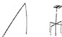
Pole and lines

A pole and line consists of a hooked line attached to a pole.