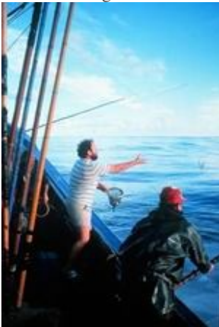
Chumming of baitfish

3. Chumming is the scattering of live bait into the sea. The spray system is an important adjunct used in chumming and fishing. It gives the illusion that the water surface is alive with small fish causing the tuna to go into a feeding and biting frenzy. Once a school is sighted or located a given fisherman starts throwing live baits in every direction behind the vessel. At the same time, side and rear sprinklers are activated in order to create the illusion of a large school of small fish running near the surface. This illusion and the baits thrown continuously by the fisherman attract and concentrate the tuna school in the trail of the vessel. Small scoop nets are used to scoop the crowded bait out of the tank during the fishing operation. It may happen that large purse seiners makes an agreement with a pole and line vessel for encircling the tuna aggregated by chumming of baitfish (and the pole and line vessel) with its purse seines . In this case, the actual fishing is not done by the pole and line but only by purse sein. Baitboat gets its share in terms of fish or money. Some pole and line boats only operate in this way throughout a trip with a contract with a seiner. Therefore evaluation of effort of baitboats has to be made with much care.