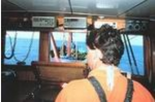
School sighting and locating

2. Tuna schools can be located using different ways: by visual spotting (sea birds, or behaviour of fish species jumping, breezing, boiling, sea surface); by using acoustic instruments (echosounder, etc.) or by using a jig line towed behind the boat. Recently artificial fish aggregating devices are often used as the fish aggregate near this floating object.